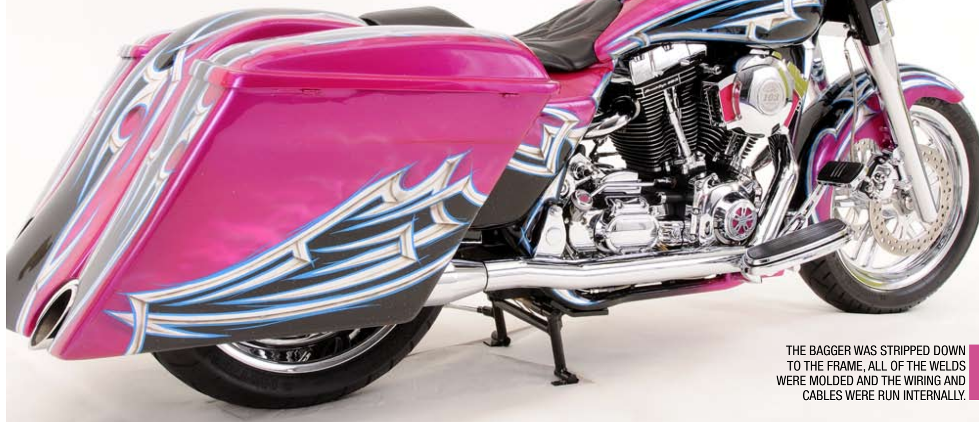
THE BAGGER WAS STRIPPED DOWN TO THE FRAME, ALL OF THE WELDS WERE MOLDED AND THE WIRING AND CABLES WERE RUN INTERNALLY.